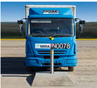
Safetyflex also offer a selection of shrouds and street furniture. Details available on request.